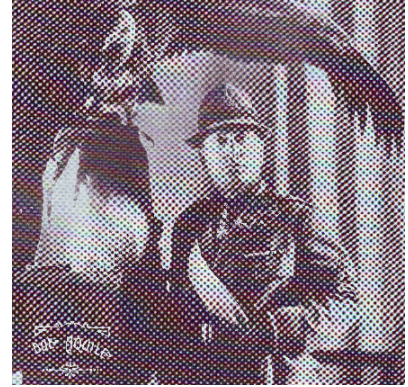
Mussolini, in National Militia uniform, keeping an eagle eye on Italy.

Nov 7. Benito Mussolini, the blacksmith's son from poverty-stricken Romagna, has declared himself "Il Duce", the leader of the National Fascist Party. Formerly a Socialist and editor of the Milan Socialist Party's newspaper, Avanti, before the war, the square-jawed Mussolini is now violently opposed to Socialism.